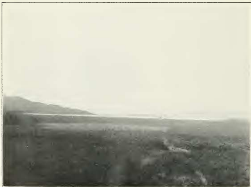
THE ÉTANG SAUMÂTRE. Near Glore, Haiti, May 22, 1931.